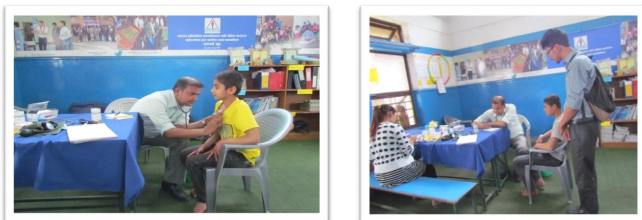
Figure 1 Medical team examining children during the health camp organized by MDN

MDN organized a health camp for underprivileged and disadvantaged children of age 7 to 17 on April 07, 2017. These children are generally from street and homeless. They are being sheltered by a nongovernmental organization called UNEP (Underprivileged Children's Educational program). After visiting their facility in Sanothimi, MDN expressed its willingness to collaborate with UNEP. After a brief meeting we decided to conduct a health camp for those children. For this purpose, Korea-Nepal Friendship hospital was approached and they were kind enough to provide us the medical team for the camp voluntarily. Basic health check-up of all the children were done. Most of the children were healthy, some were suffering from cough and cold and some were referral cases. MDN also provided the medicines to children as prescribed by the doctors during the health camp. UNEP appreciated our effort and shared that this would help them to keep health records of children and will come in handy in future. MDN plan to collaborate with such organizations and continue such programs in future too.