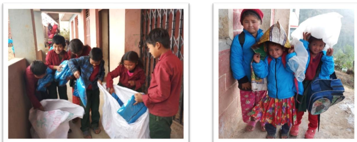
Figure 8 Student of Seti Devi receiving windproof jackets and wearing them