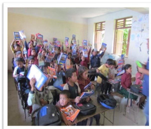
Figure 6 Handing over the stationery materials to teachers of Seti Devi School, Dhading by MDN team.