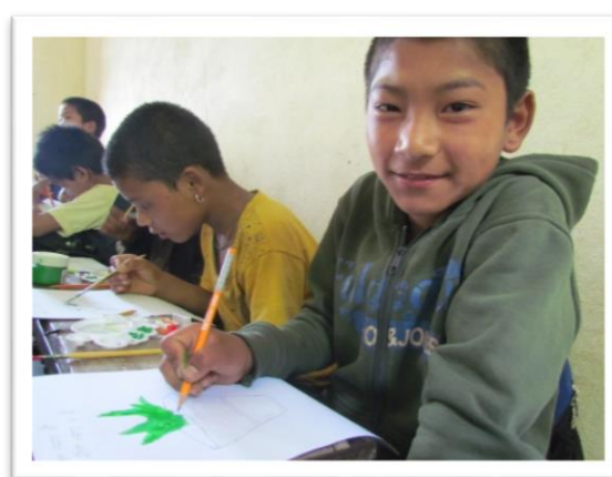
Figure 7 Children participating in art competition organized by MDN in Seti Devi School, Dhading.

Nava Adarsha is a government school. We have noticed that this school as any other government school in Nepal lacks many basic facilities that are essential for quality education. When we visited the library, the teachers shared that it has not been updated since many years as the school do not have sufficient resources. Reading books develops child's brain, ability to focus and concentration. Thus, on September 03, 2017, MDN donated 32 English books including novel like alchemist and other to Nava Adarsha School library. These new books seemed to create interest amongst student. We hope these new addition of books will build enthusiasm amongst student to learn and explore.