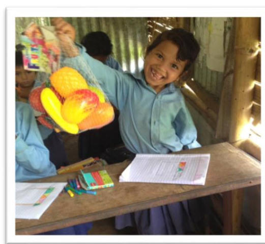
Figure 5 Distribution of stationeries to student of Gyambhumi by MDN