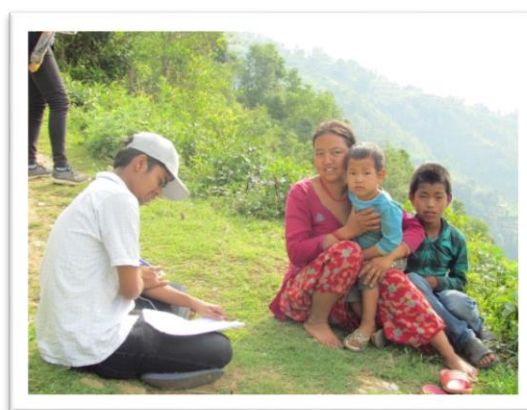
Figure 11 MDN team interacting with the community members during the monitoring and evaluation visit