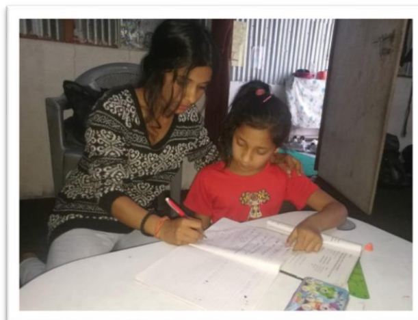
Figure 10 Tuition classes for children of slum area organized MDN