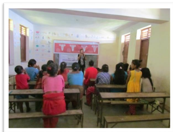
Figure 9 Awareness raising program on Menstrual Hygiene organized by MDN