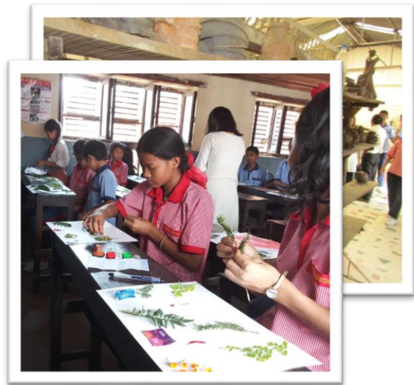
Figure 5 Children participating in print art workshop.